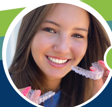
SPARK Clear Aligners