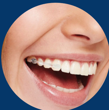
Overbite or Underbite